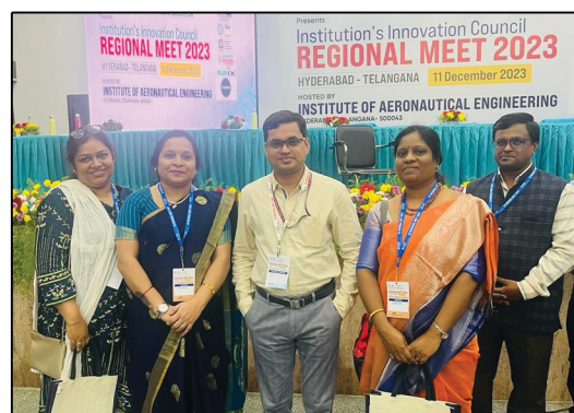
IIC Regional Meet