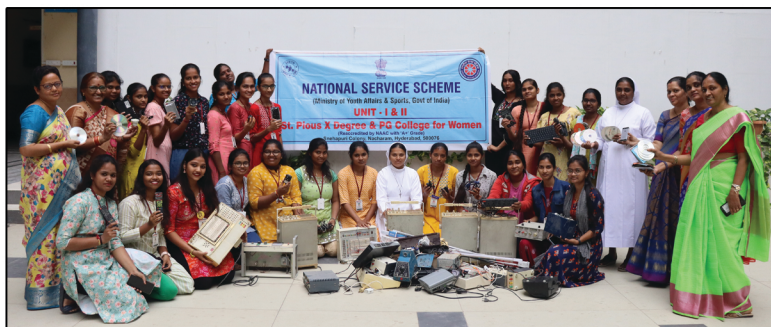
Awareness on Pollution by E - Waste

National Pollution Day was observed by department of Physics in collaboration with NSS unit I and II on 2 December 2023. An awareness programme on "Pollution Caused by E - Waste" on 4 December, 2023 was conducted followed by E - waste collection from students and faculty which was disposed in an eco-friendly manner for a sustainable future.