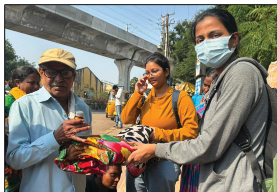
Donating a blanket