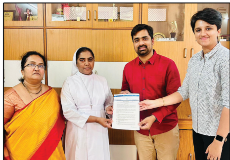
MOU with Crake'd