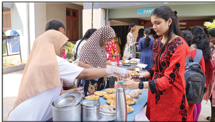
Food Stalls by Students

Food stalls were put to showcase diverse recipes using pulses.