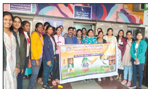
Students with Hyd Contingent Leader RDP Camp 2024