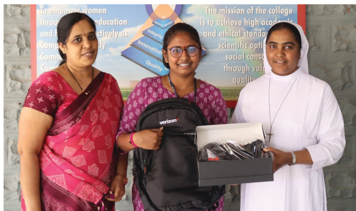
Moment of Pride