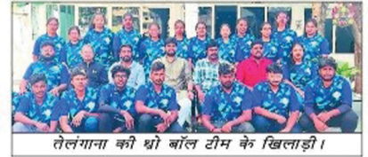
तेलंगाना की थ्रो बॉल टीम के खिलाड़ी।