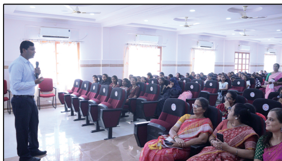
Expert Talk on ‘Unleashing Innovation and Impact’