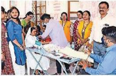
పరీక్షలు చేయించుకుంటున్న ఉపాధ్యాయురాలు, విద్యార్థులు