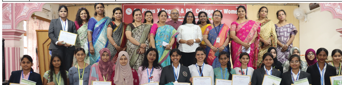
Prize winners of Management Day