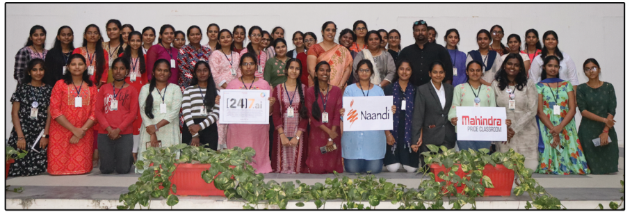
Placement Drive Participants

Placement Committee organised placement drive by AI for all the streams of final year degree students on 29 January 2024. 58 students got selected.