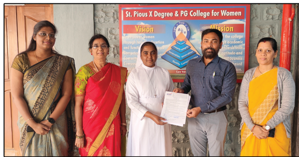
MOU with KSG IAS