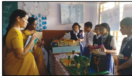
Judging the models @ St. Pious X high school