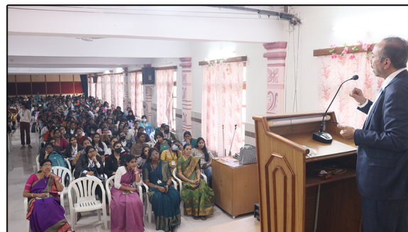
Orientation on UPSC Civil Services Exam