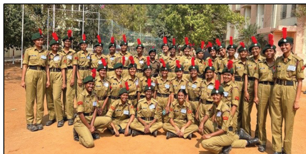
Drill movements of Cadets