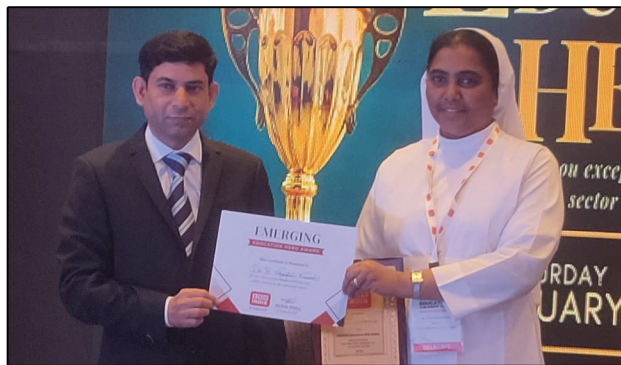
Principal Receiving EGN Award

Congratulations Sister! Your strategic leadership with utmost commitment and dedication is a great direction for all of us.