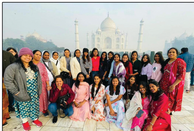
National Trip to Agra