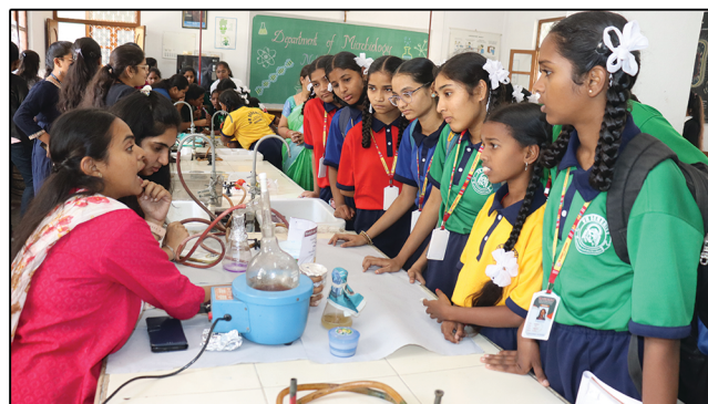
School Students at National Science Day

On the occasion of National Science Day, the departments Sciences organised National Science Day on 28 February 2024. The students enthusiastically exhibited various working models, games, charts, demos and fun activities and actively involved in demonstrating the working models, explaining unique science related topics. 320 Students from various schools visited and appreciated the event.