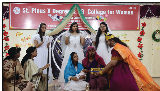
Christmas Celebrations FELIZ NATAL