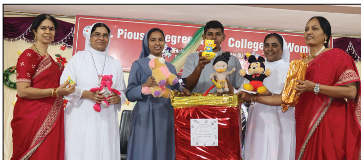
Salesian Sister of Auxillium Navajeevan receiving the Donation